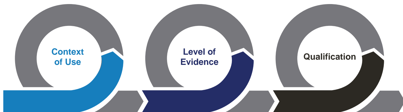
Exhibit 3. The Context of Use Determines the Level of Evidence Needed to Support Biomarker Qualification

complete and precise statement that describes the appropriate use of the biomarker and how the qualified biomarker is applied in drug development and regulatory review. The COU determines the level of evidence necessary to obtain biomarker qualification ( Exhibit 3 ). When requesting biomarker qualification, there are several key steps in the review process.