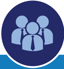
Exhibit 2. Opportunities for Engagement with CDER During Biomarker Development