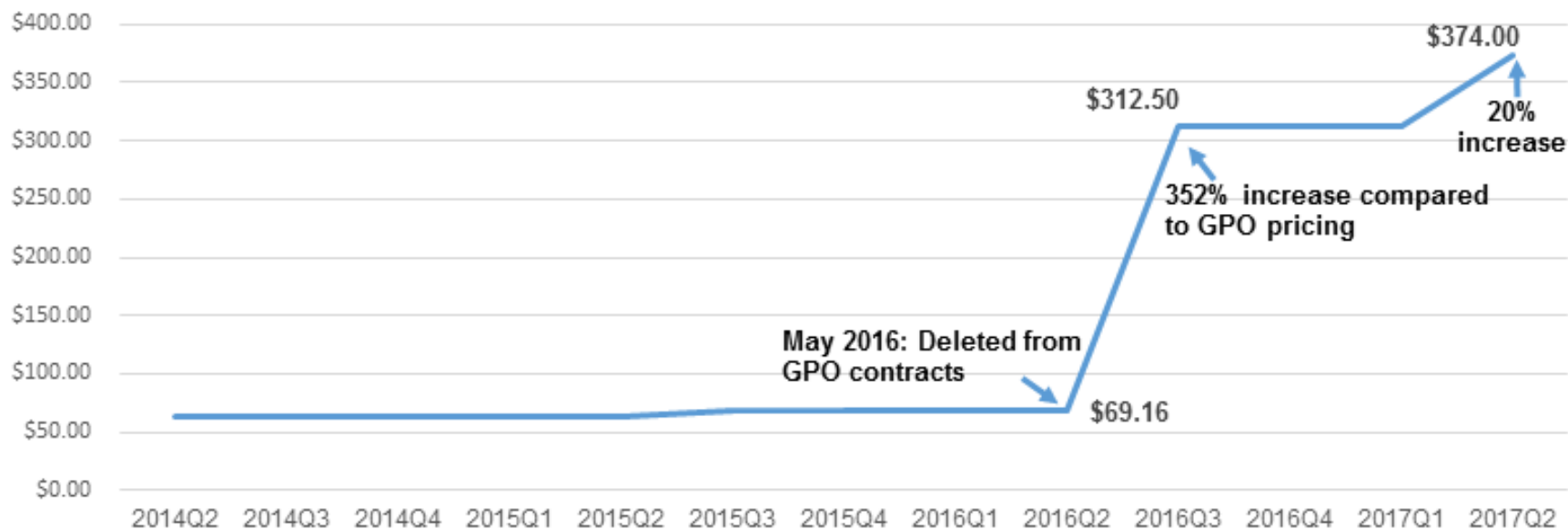
Epinephrine NDC 42023015925