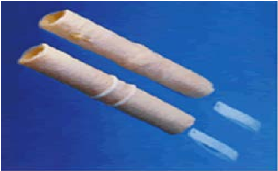
Figure 1. Contegra 200 and 200S (ring-supported) Models

Contegra is a glutaraldehyde-crosslinked, heterologous bovine jugular vein with a competent tri-leaflet venous valve. The device is available in 6 sizes in even increments between 12 and 22 mm inside diameter, measured at the inflow end. The device is available in two models (Figure 1): one without external ring support (Model 200), and one with ring support modification (Model 200S).