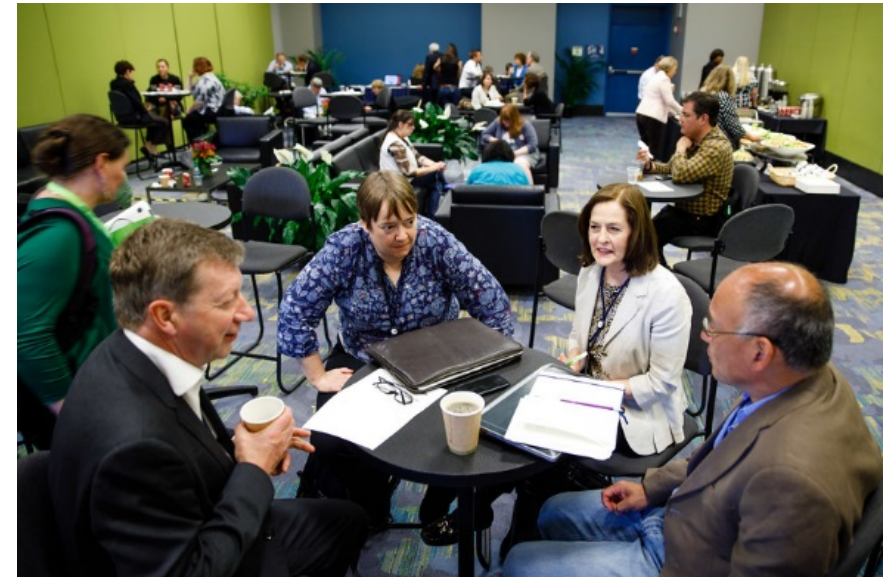
Advocates meeting in the Patient Advocate Lounge

Special educational meetings and networking opportunities