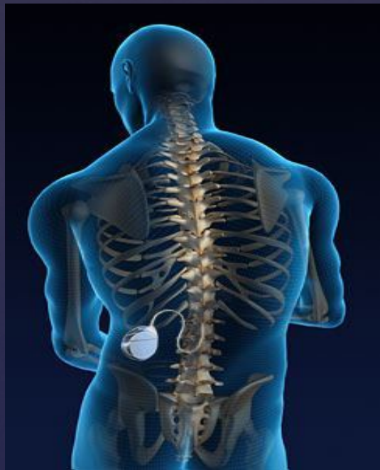
Intrathecal pain pumps