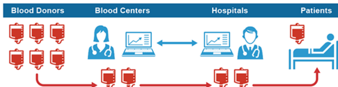
Image: The amount of blood that is collected and used in different regions of the country varies. The FDA model of the U.S. blood supply enables public health officials to estimate the availability of blood in each region at any given time. This helps minimize disruption and avoid shortages in the blood supply.

FDA has developed a model that estimates the amount of blood available in the U.S. during both routine conditions and emergencies. It can be valuable for emergency preparedness planning and for responses requiring blood transfusions.