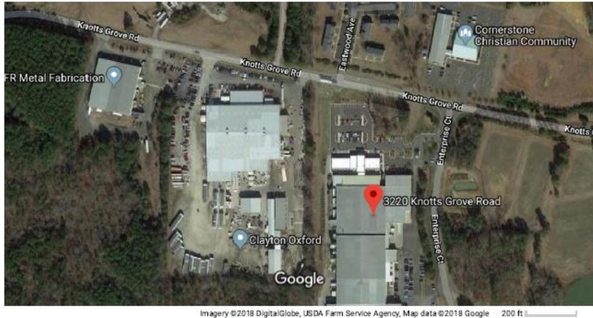
Figure 1. Location of the Manufacturing Facility

The manufacturing facility is located in Granville County in the Fishing Creek subwatershed, hydrologic unit code 03020101, in the Tar River basin. 1,2 The facility is surrounded by woodlands; bounded by a residential area to the north; mixed use residential and commercial lands, and Interstate 85 (a four-lane, divided highway) to the west; and a fresh produce farming establishment to the southeast.