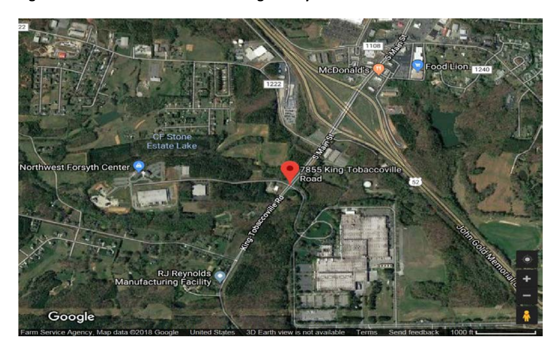
Figure 1. Location of the Manufacturing Facility

The new products would be manufactured at the address listed in section 1 of this document (Figure 1).