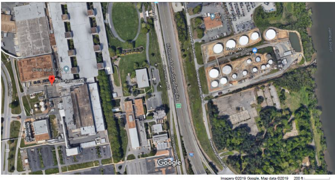
Figure 1. Location of the Manufacturing Facility

The manufacturing facility is surrounded by a residential development across a road to the north; a two-lane divided road and an interstate freeway (I-95) to the east; two hotels, a fast food restaurant, and a gas station at the southeast corner; undeveloped forested land and a petroleum product pumping