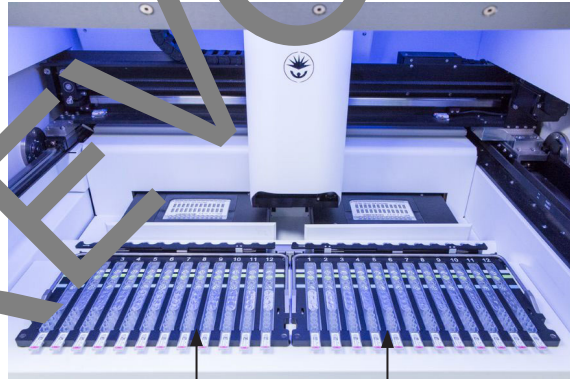
Side A Side B