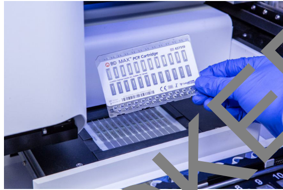
Figure 2: Load BD PCR Cartridges