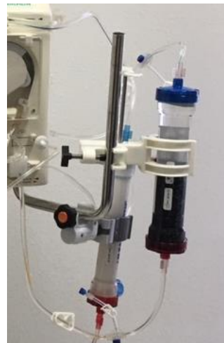
Figure 1 Image of D2000 in Fluid Circuit

Prime with 1L Normal Saline (NS). Once saline has entered column gently agitate column to ensure contents of column have not settled in device. The goal here is to have a uniform distribution of resin mix inside the column. Prime can be performed at up to 100 mL/min.