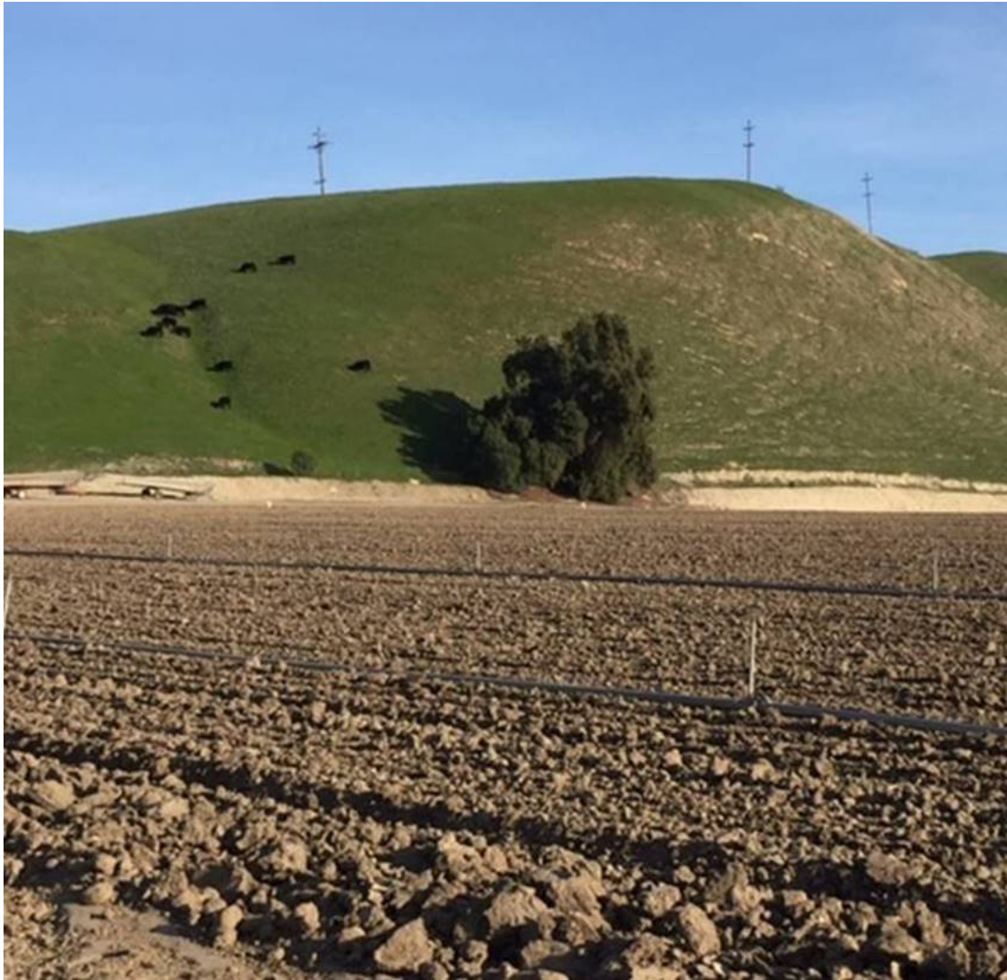
Figure 3. Proximity of cattle grazing land in hills above leafy green fields.

Note: photograph not of a field directly tied to the investigated outbreaks, but intended to show suboptimal proximity of cattle and leafy greens operations.