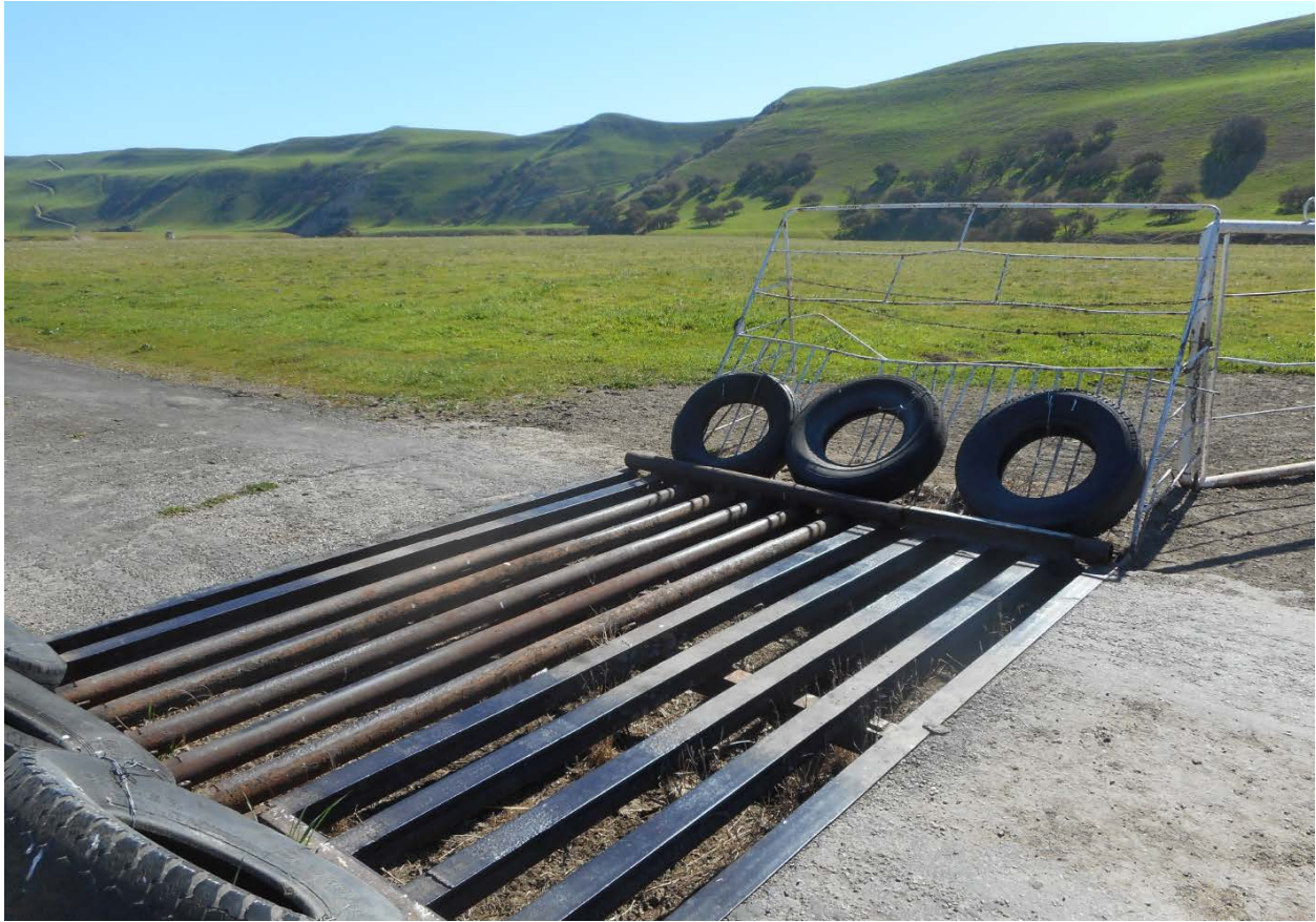
Figure 2. Cattle Grate where a fecal-soil composite sub-sample was collected that matched Outbreak Strain A.