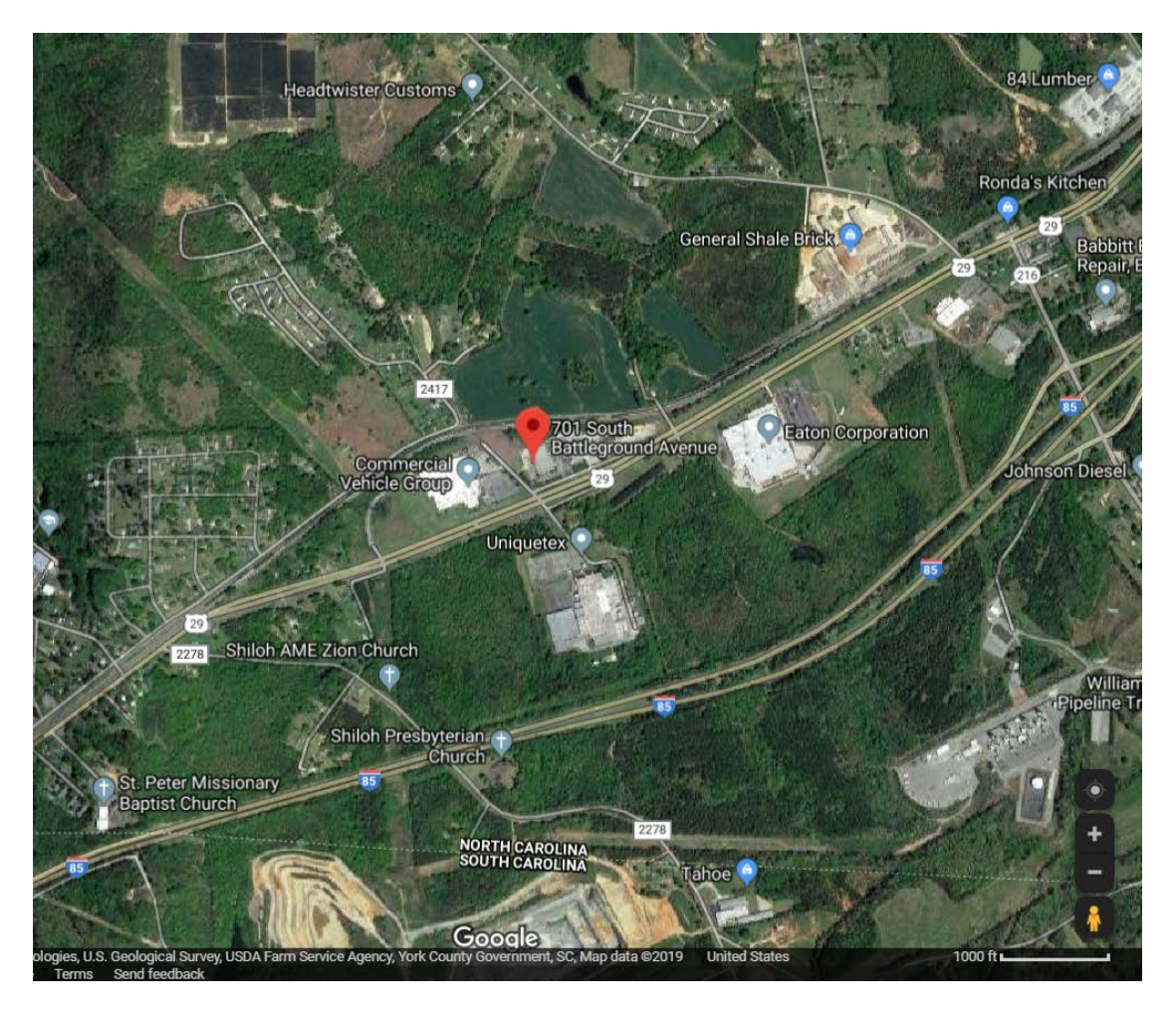
Figure 1. Location of the Manufacturing Facility

The manufacturing facility is surrounded by forest, farmland, and several industrial and commercial buildings. A freeway is located to the south and a railroad to the north. Residential areas are located to the west and northwest.<sup>1</sup>