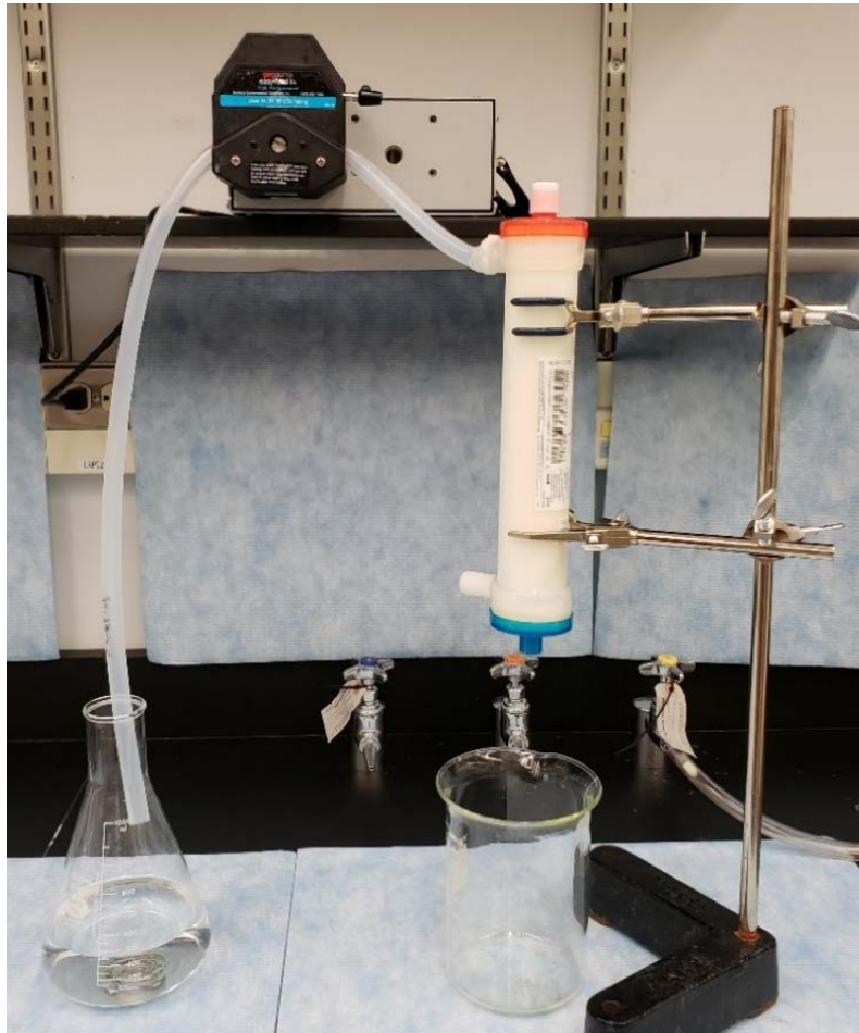
Figure 2 Backflush assembly