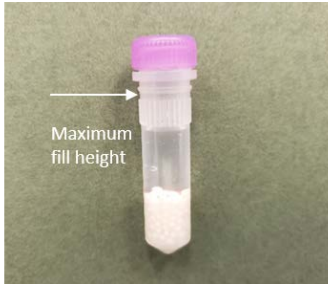
Figure 4 Maximum fill height for LME tubes