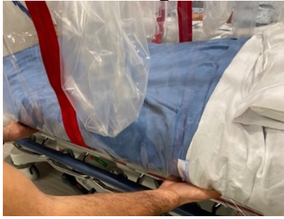
Figure 2: Correct tent configuration for ED stretcher