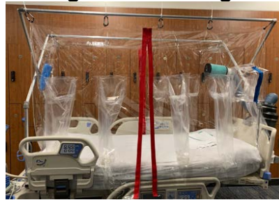
Figure 3: Correct tent configuration for regular floor and ICU beds