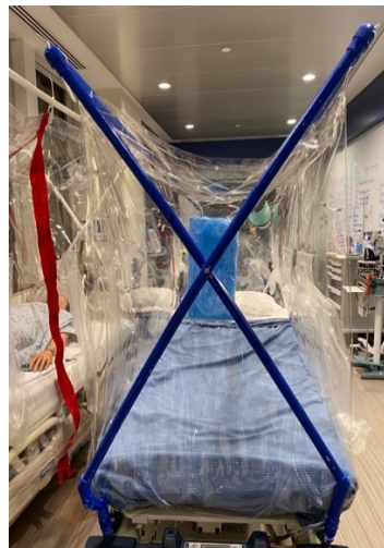
Figure 4: Hour-glass tent conformation