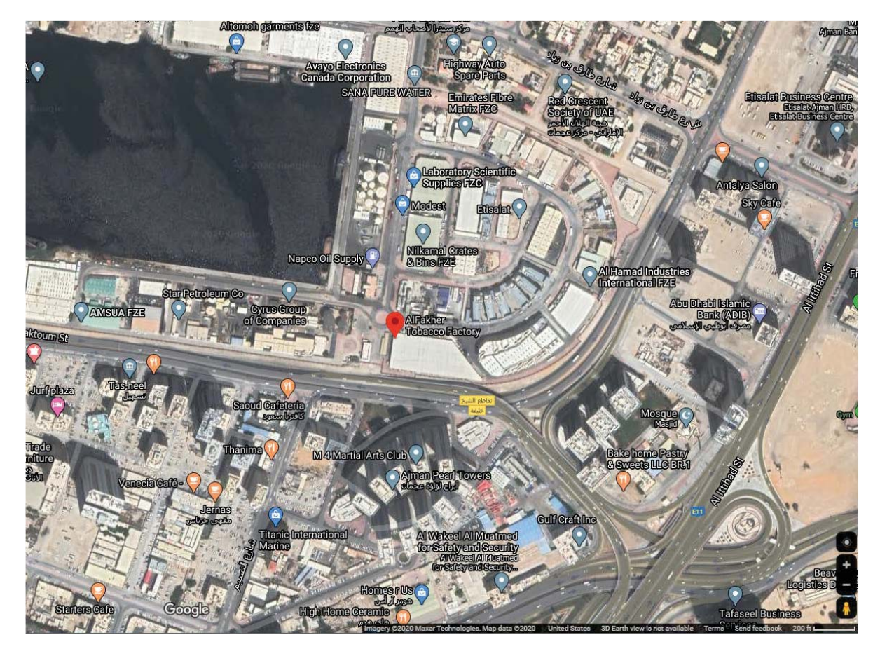
Figure 1. Location of the Manufacturing Facility

The manufacturing facility is located in Ajman, United Arab Emirates. The facility is located in a densely populated mixed residential, commercial, and industrial area. A harbor is located to the west, which opens to the Persian Gulf. The facility is located on a major highway.