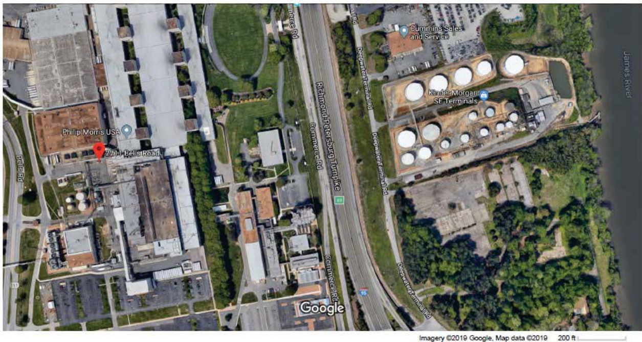
Figure 1. Location of the Manufacturing Facility

The manufacturing facility is surrounded by a residential development across a road to the north; a two-lane divided road and an interstate freeway (I-95) to the east; two hotels, a fast food restaurant, and a