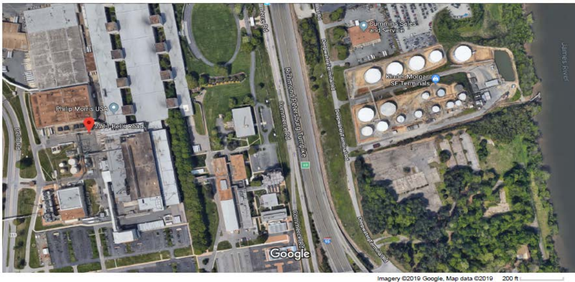
Figure 1. Location of the Manufacturing Facility

The affected environment includes human and natural environments surrounding the manufacturing facility. The new products would be manufactured at 2211 Bells Road, Richmond, VA 23234 (Figure 1) and the subcontracted manufacturing facility (Confidential Appendix 1).