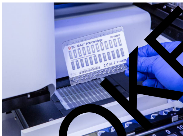
Figure 2: Load BD MAX™ PCR Cartridges