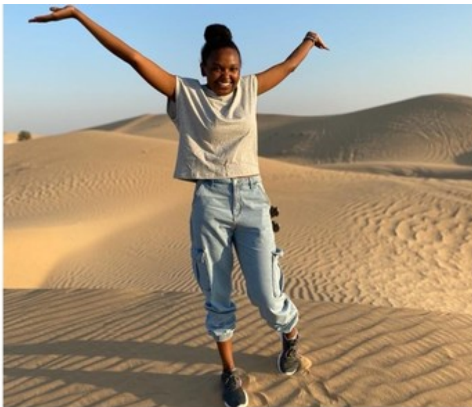
Inspector Found Her Calling Through Experiences