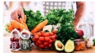
Timely Updates on AgWater Rule