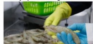
U.S., EU Conclude Negotiations