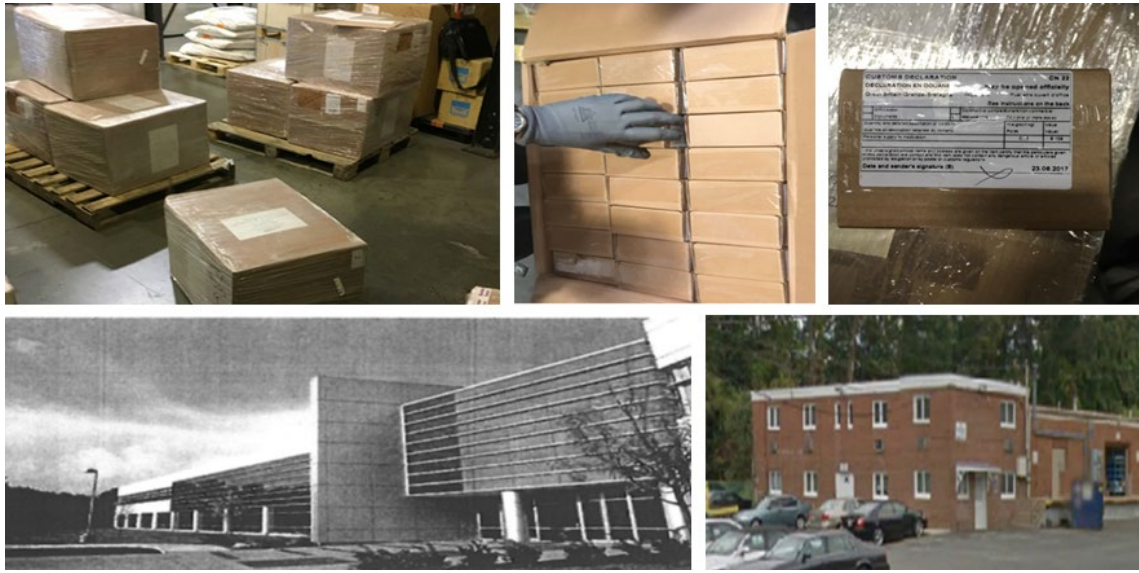
Images from Operation Lascar. Top row: example of transshipped product in the U.K. made ready to ship to the U.S. Bottom row: (left) how one such player advertised themselves; (right) what they really looked like.

At the time, many of the illicit medications (including counterfeit products), were intended to treat serious and life-threatening conditions, such as various forms of cancer, and required strict temperature controls to be administered safely. Further, the underlying distribution model had changed from direct-to-consumer sales to one which sought to penetrate the FDA-regulated pharmaceutical supply chain with targeted sales to physicians. In turn, these products were being administered to unsuspecting patients who were unaware these products were being obtained from unauthorized foreign sources and being shipped and stored outside of approved conditions.