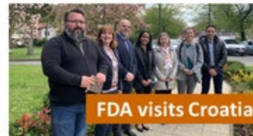
FDA visits Croatia