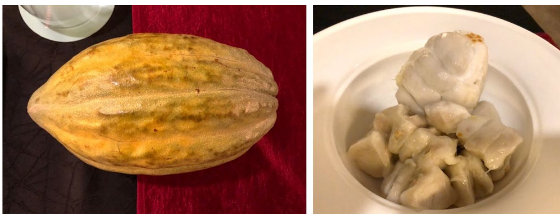
A fresh-picked cocoa pod reveals large pulp-covered seeds. To obtain the beloved chocolate flavor, the seeds need to undergo a drying and fermentation process to become “cocoa beans.” The cacao tree is an Amazon rainforest native, which has been introduced around the world to other equatorial growing zones.

The Idukki region is also known for producing turmeric, bay leaf, and cocoa. On their drive up to Puttady, McMullen and Panda saw cocoa trees with immature pods still a few months away from harvest. They got to taste the inside of a raw cocoa pod, thanks to their enterprising driver who removed a pod from a tree for the ladies to taste. “It was sweet and sour at the same time, nothing like chocolate tastes!” noted Panda.