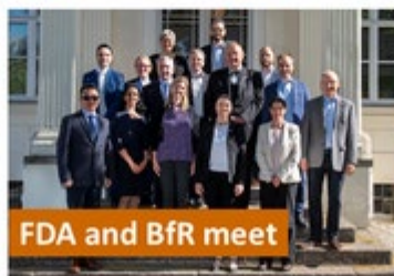
FDA and BfR meet