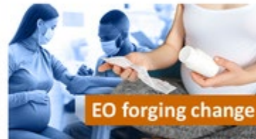
EO forging change