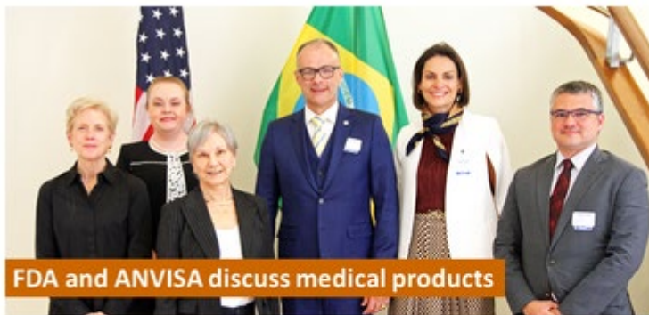
FDA and ANVISA discuss medical products