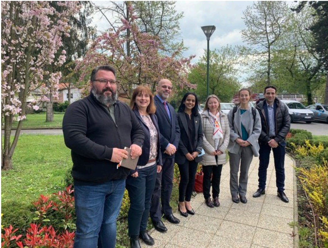
FDA Europe Office staff members with their Croatian regulatory counterparts.