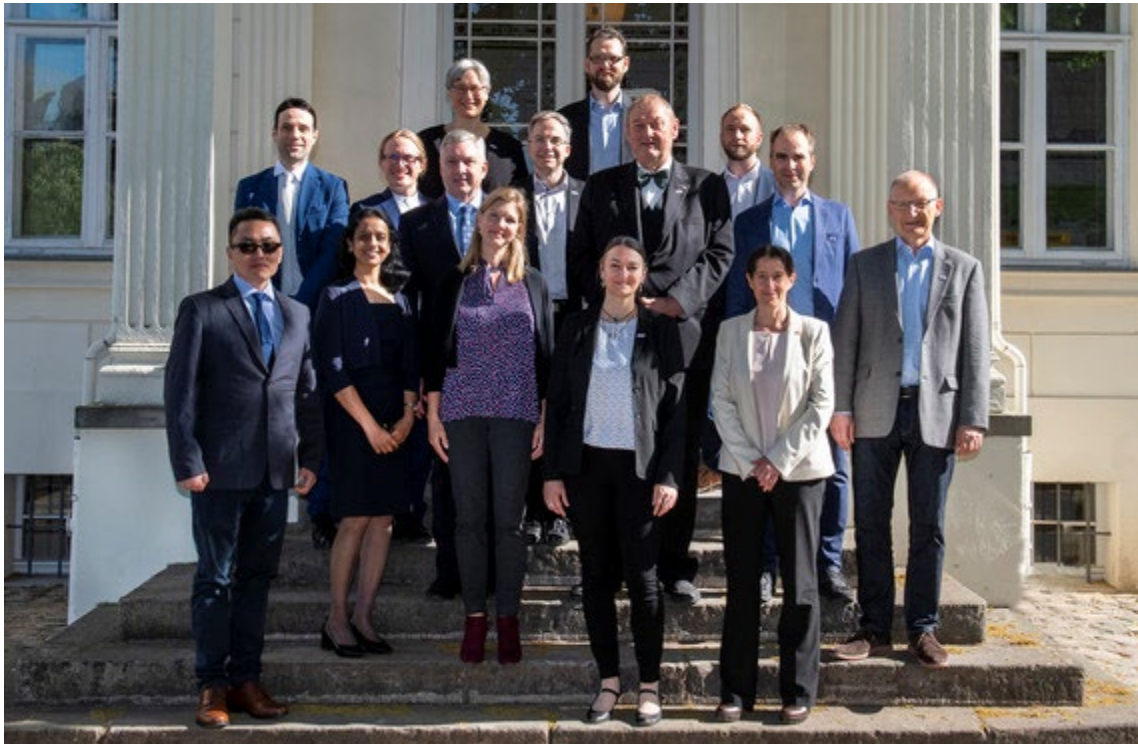
FDA officials recently held productive talks in Berlin with representatives from counterpart agency the German Federal Institute for Risk Assessment. The meeting was held to launch the MOU signed by the two agencies last year.

Considered to be the FDA's "sister agency" in Germany, the BfR is a scientifically independent institution within the Federal Ministry of Food and Agriculture in Germany. The BfR advises both the German federal government and states on questions of food, chemicals, and product safety, while conducting independent research on topics closely linked to the agency's assessment tasks.