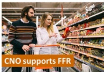
CNO supports FFR