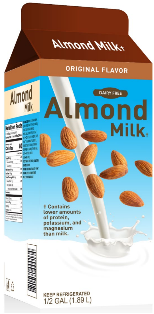
Figure 6: Example of Voluntary Nutrient Statement on Product Label When Name Appears on Label Multiple Times - Close-up of Symbols and Voluntary Nutrient Statement

Figure 5: Example of Voluntary Nutrient Statement on Product Label When Name Appears on Label Multiple Times