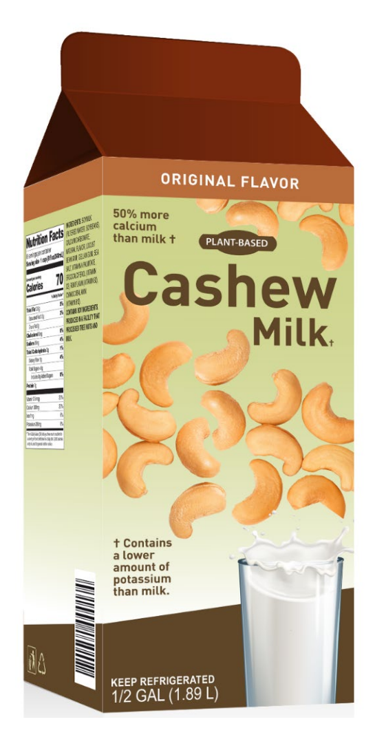
Figure 10: Example of Voluntary Nutrient Statement Using a Symbol next to a Relative Claim Comparing the Product to Milk - Close-up of Relative Claim and Voluntary Nutrient Statement