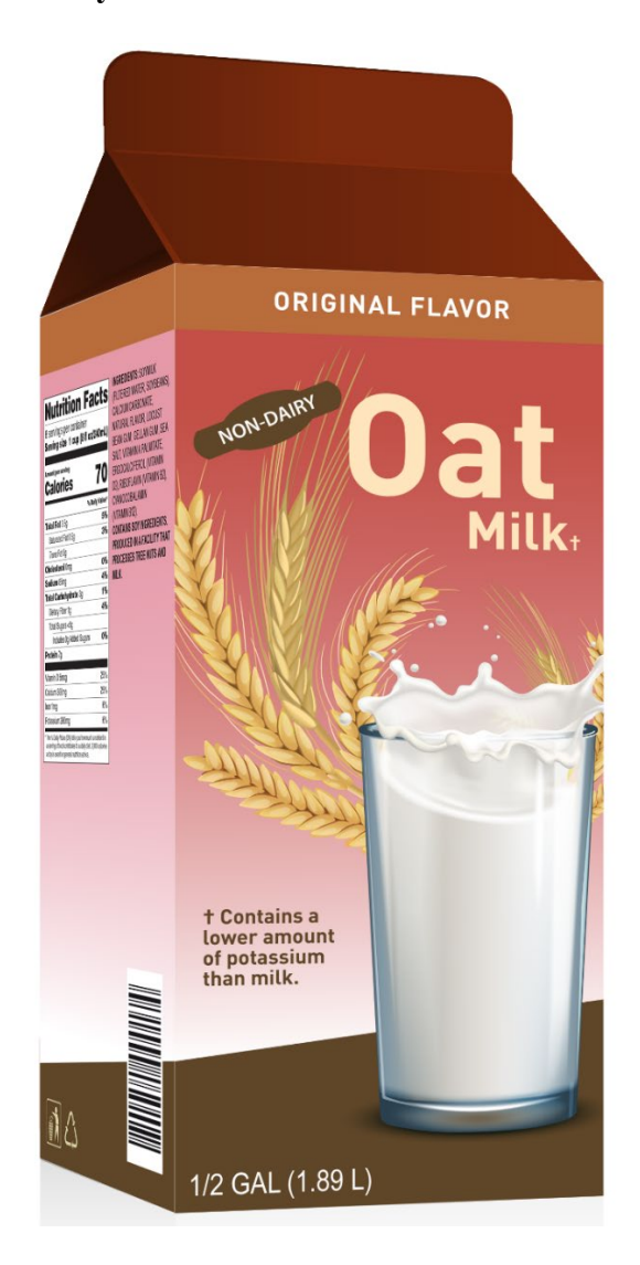
Figure 4: Example of Voluntary Nutrient Statement on Product Label Using a Symbol - Close-up of Symbol and Voluntary Nutrient Statement