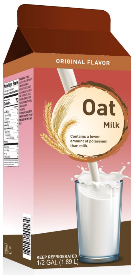
Figure 2: Example of Voluntary Nutrient Statement on Product Label next to Product Name - Close-up of Voluntary Nutrient Statement

Figure 1: Example of Voluntary Nutrient Statement on Product Label next to Product Name