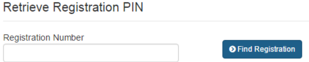
图 2 - 找回注册密码