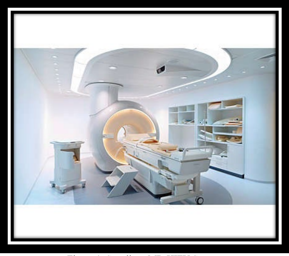
Figure 1: Sonalleve MR-HIFU System

The Sonalleve MR-HIFU Therapy system consists of the following main components: