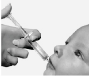
Figure 1. Administration of ROTARIX

Your baby will get the first dose at around 6 weeks old.