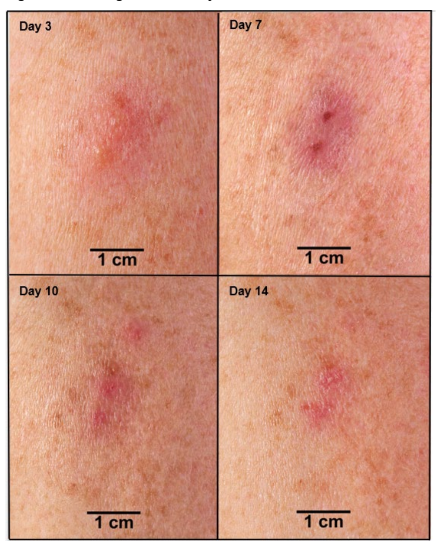
Figure 2 Progression of Major Cutaneous Reaction After Revaccination (1)