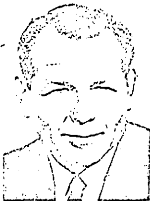
ROBERT FINCH Nixon's H-E-W Secty.

Running through most of the Nixon-oriented commentary on the future of FDA is the feeling that the most important ingredient -- from the standpoint of the public as well as the industry -- is a strong and able administrator for the regulatory agency. On this point, there is somewhat of a gap between the thinking of the pharmaceutical industry and others regulated by the agency, chiefly the food and cosmetic industries.