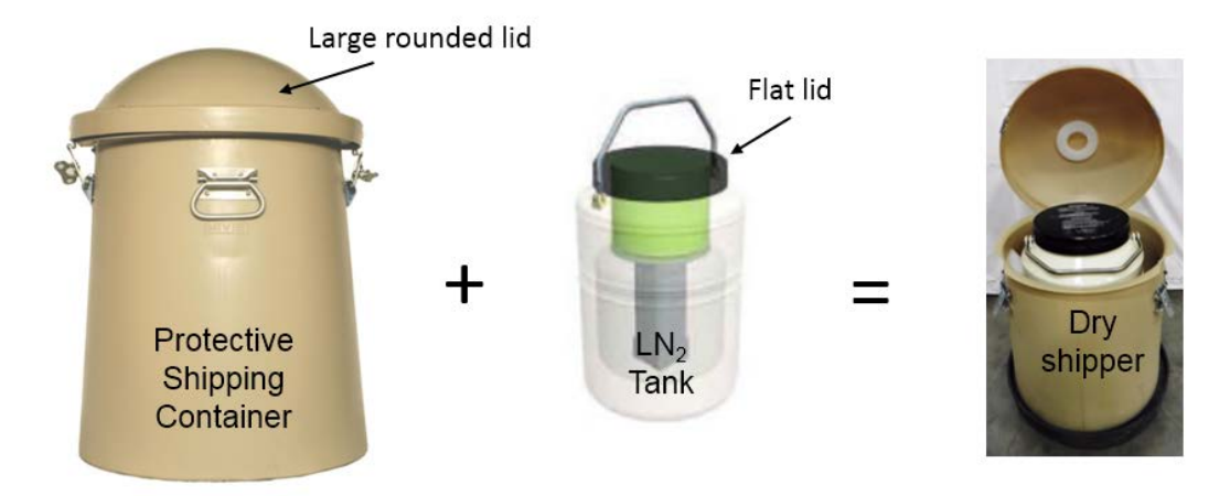
Figure 1: Dry shipper components and configuration

Use the following instructions to complete the "Dry Shipper and HPC, Cord Blood Receipt Form" confirming receipt of the CLEVECORD unit and verifying the identity of the unit for the intended recipient. Two trained transplant center staff members are required to receive and verify the CLEVECORD unit.